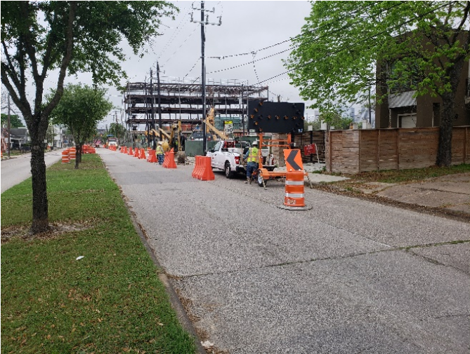
Traffic control & duct bank installation on westbound lanes of Elgin between St. Charles & Live Oak Street (04/06/20)