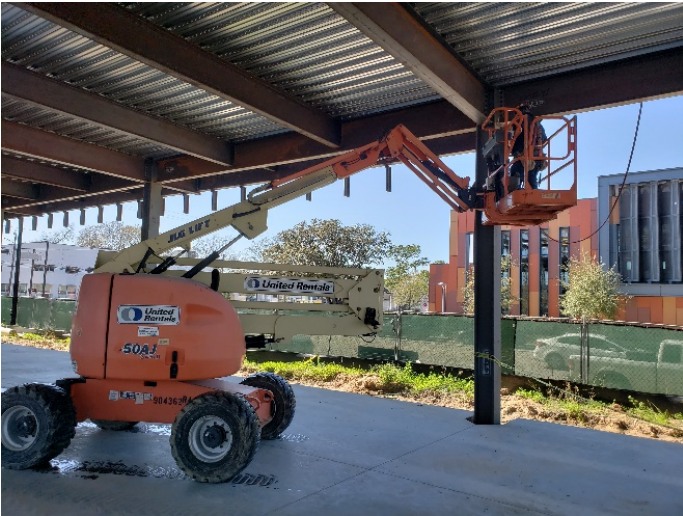
Welding Inspector checking welds for structural steel connections (02/24/20)