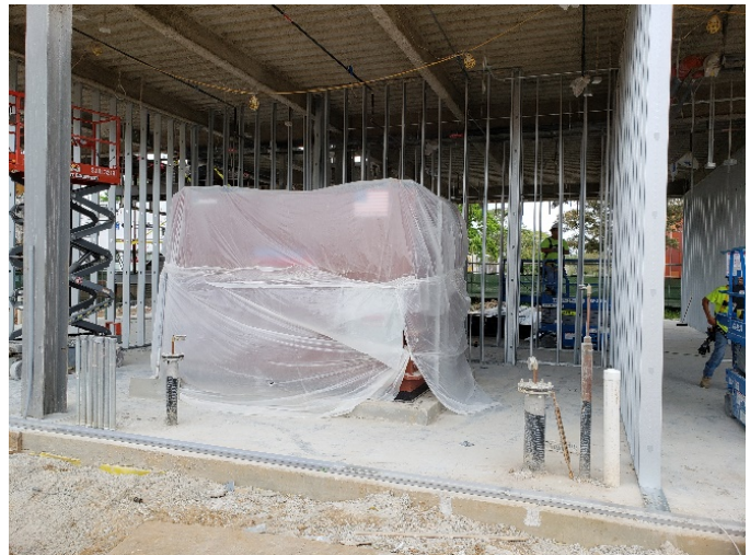
Water break tank installed on first floor of office building (03/23/20)