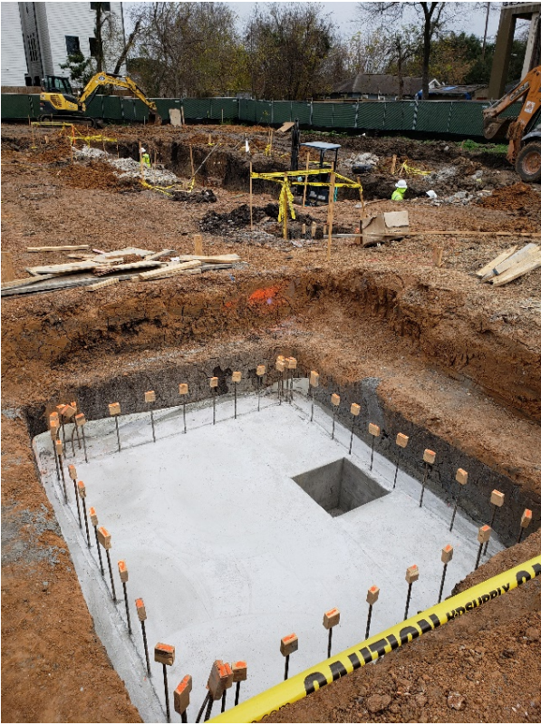
Elevator shaft cast in place for residential site (01/06/20)