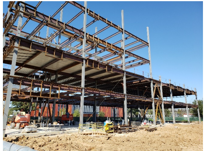
Erected structural steel up to the 5 th story (02/03/20)