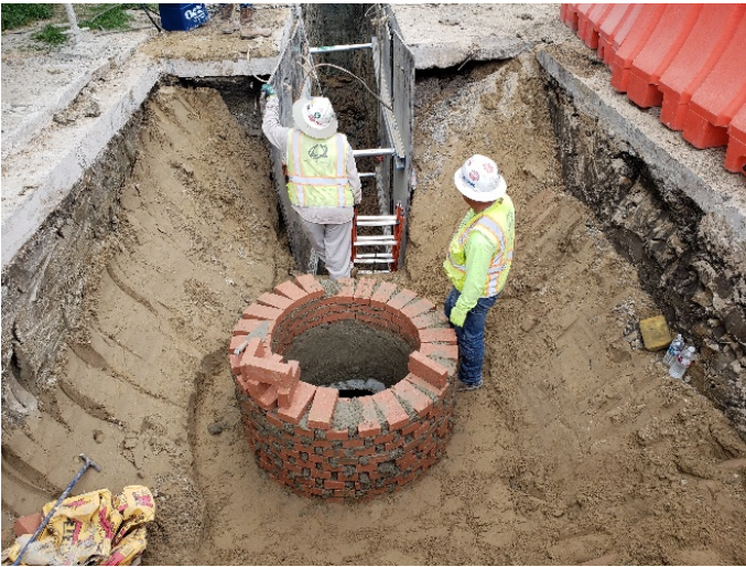
New CenterPoint ductbank and manhole on Elgin (03.23.20)