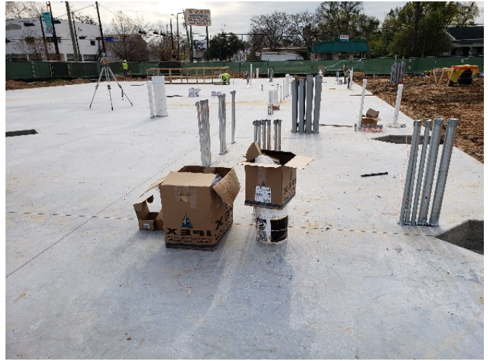
Building slab with electrical & plumbing pipe (12/17/19)