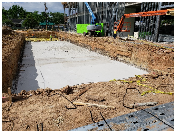
Placed concrete bottom for northern half of the stormwater detention vault under garage (04/06/20)