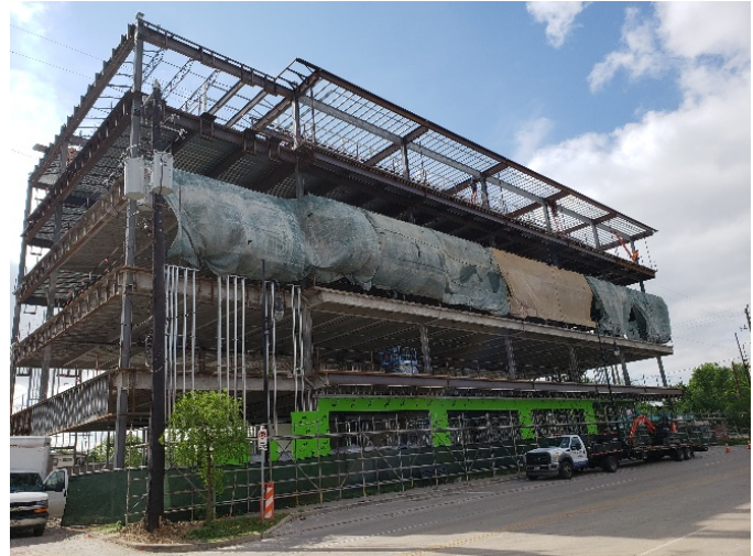
Began installing sheetrock (light green area on 1 st floor elevation) on the west side of the office building (04/06/20)