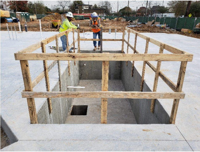
Building elevator shaft cast in place (12/17/19)