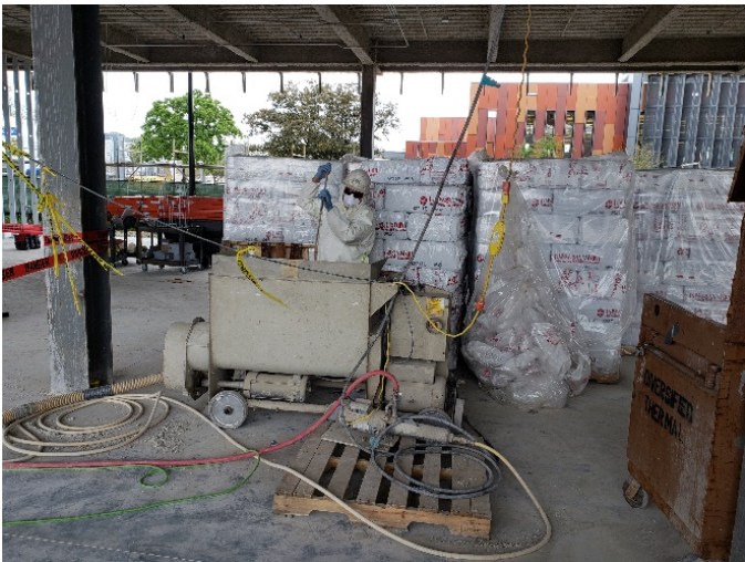
Laborer mixes fireproofing materials on the 1st floor (03/23/20)