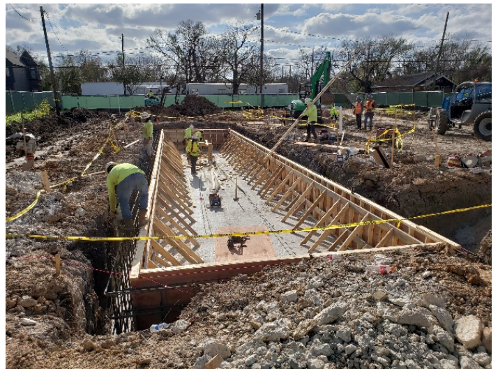
Formed walls stormwater detention vault at the residential site (01/13/20)