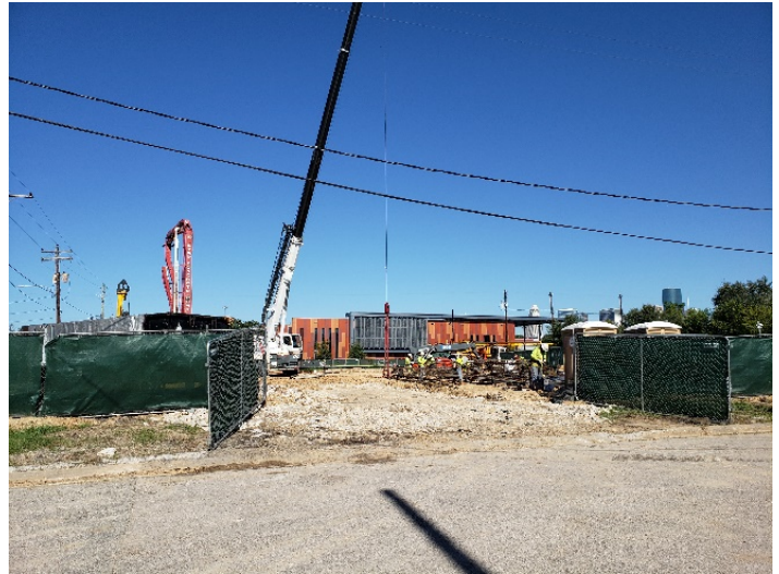
Large crane for drilling deep foundation shafts (10/29/19)