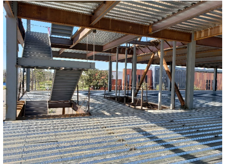
Stairs installed on upper floor levels (02/17/20)