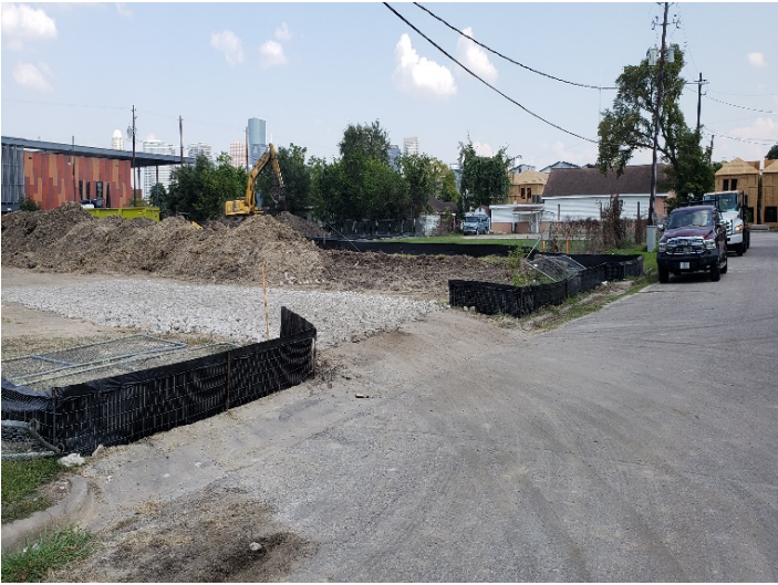
St. Charles construction entrance w/silt fence up (09/10/19)