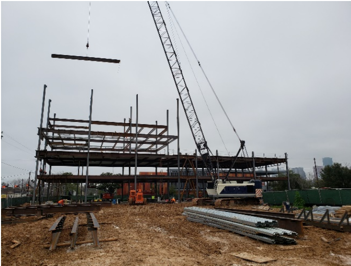
Crane swinging new steel beam into place (02/03/20)