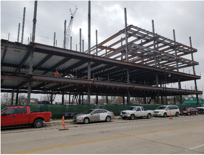
Welders working on 2 nd story structural steel frame (02/10/20)