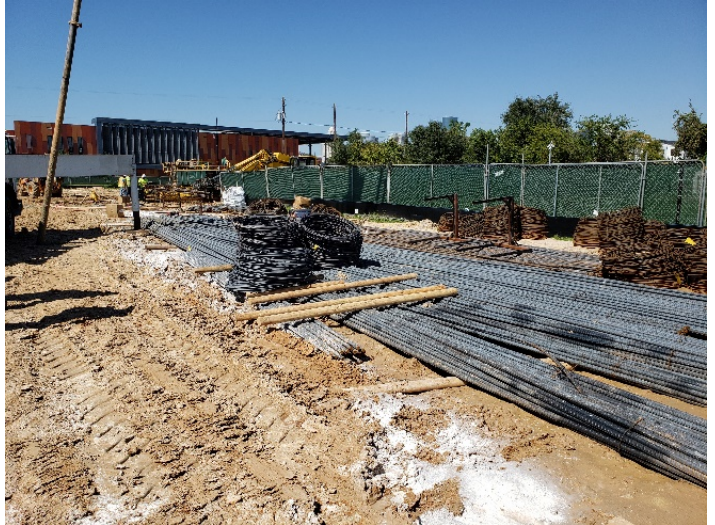
Steel stored for foundation shafts (10/22/19)