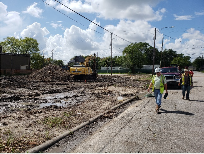
Finished clearing & grubbing at St. Charles site (09/24/19)