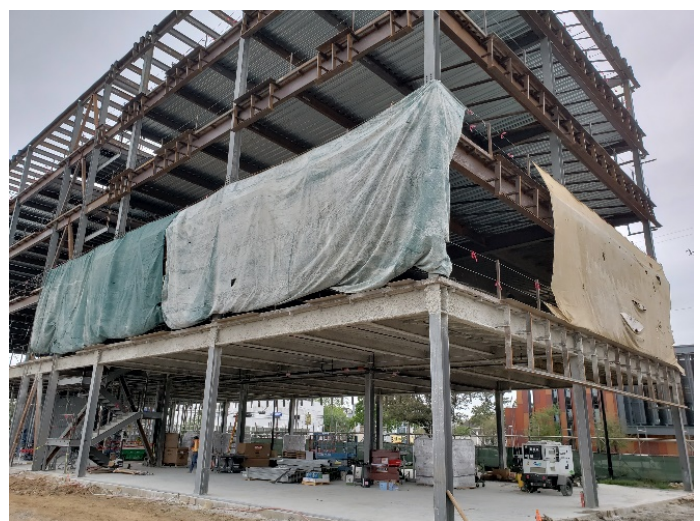
Screens in place on 2 nd story during fireproofing operations (03/23/20)