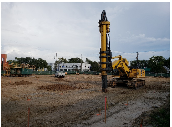
Drill rig for drilling deep foundation shafts (10/15/19)