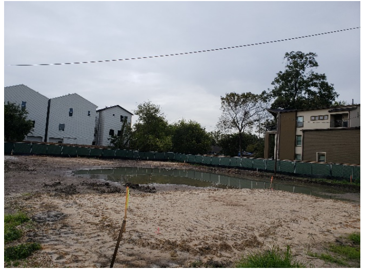
St. Charles site after a recent rain (11/12/19)