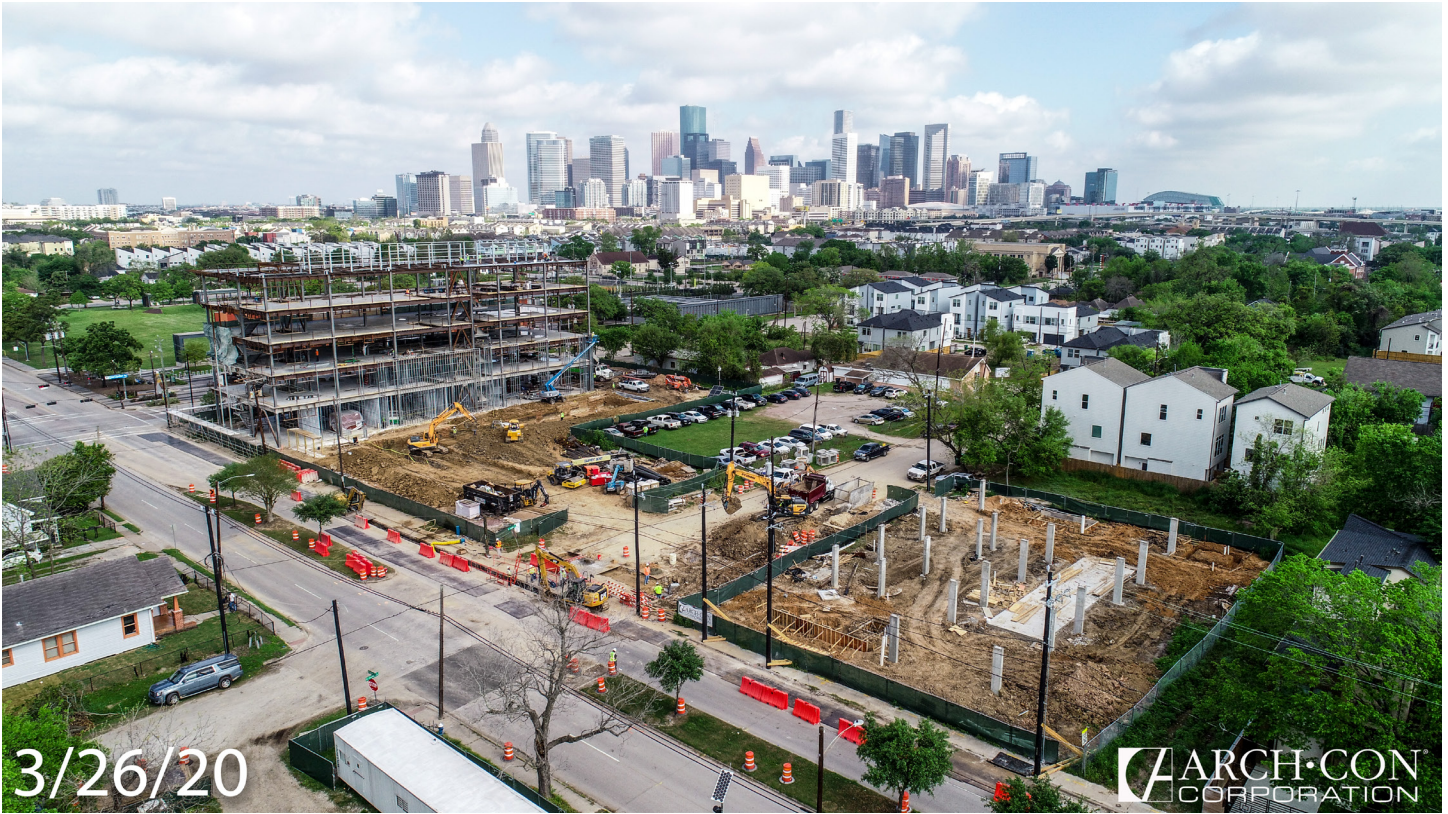
Construction Site: 3131 Emancipation Avenue at Elgin Street, Houston, Texas