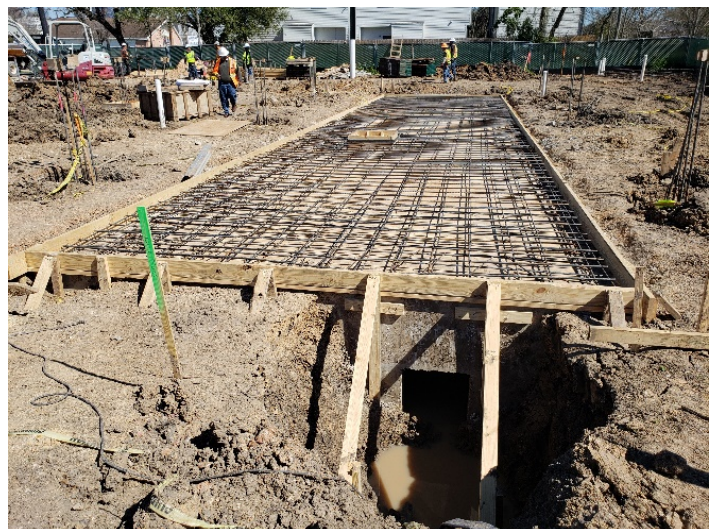
Forms & rebar in place for placement of concrete top on storm sewer vault at the residential site (03/02/20)