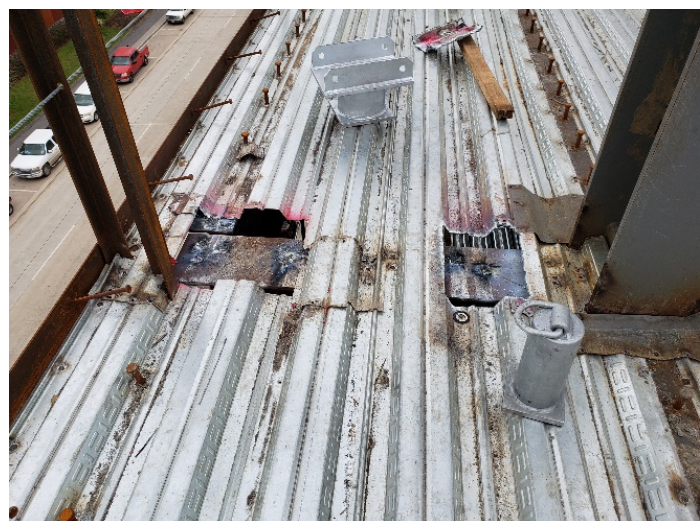
Steel davits and anchors being installed for future window cleaning operations (03/23/20)