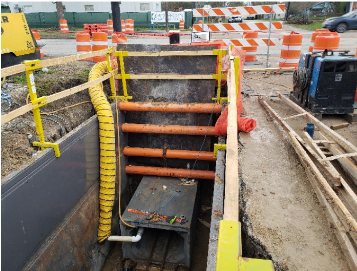
New box culvert storm sewer being installed on St. Charles across Elgin (03/16/20)