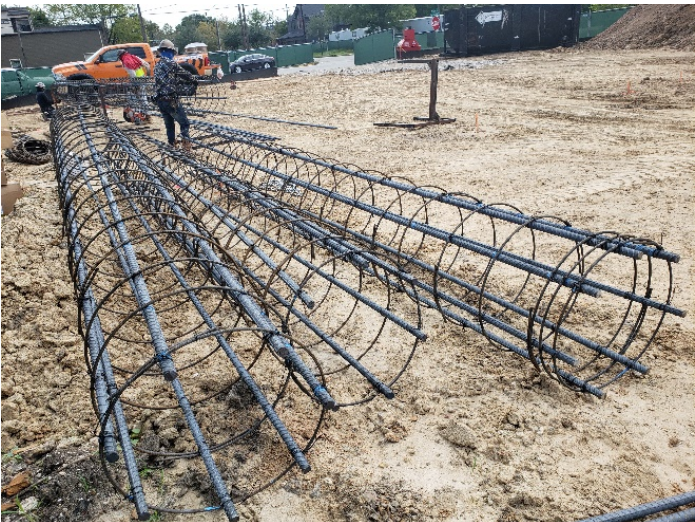
Steel rebar cages for drilled shaft foundations (10/15/19)