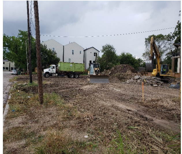
Began clearing & grubbing at St. Charles site (09/17/19)