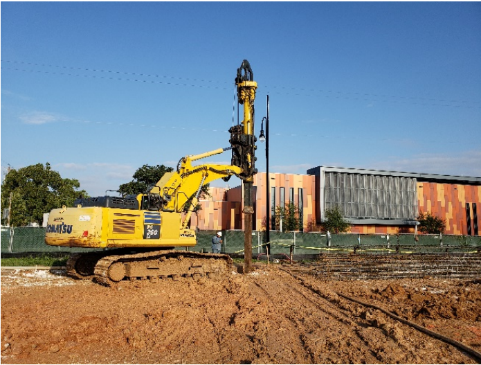
Large drill rig for drilling deep shafts (10/29/19)