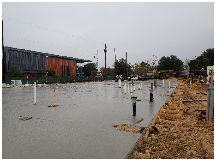
Placed concrete for building slab (12/10/19)