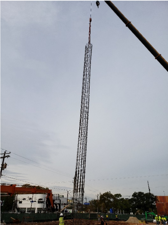
Crane lifts steel rebar cage for deep drilled shaft (11/19/19)