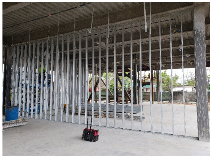
More interior wall studs installed on 1 st floor of office building (03/23/20)