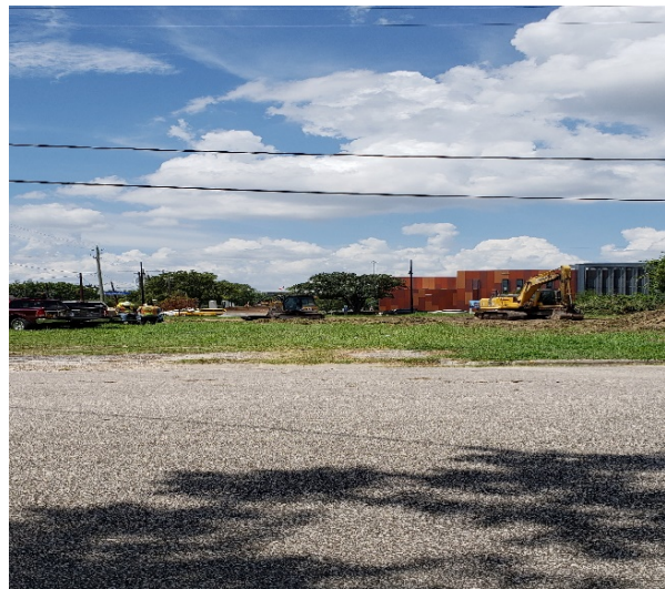
Equipment clearing grass off the surface (09/03/19)