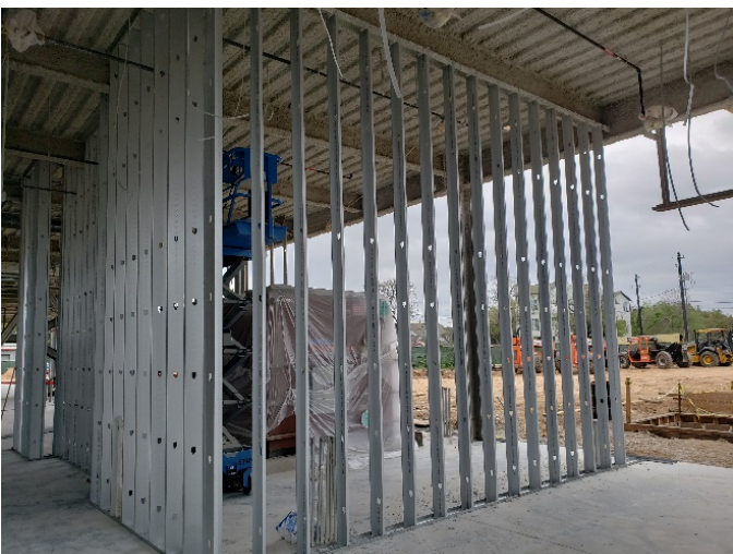
Interior wall studs installed on 1 st floor of office building (03/23/20)