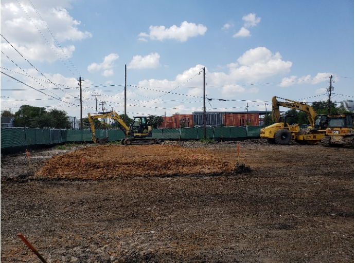
Backfilled building pads at St. Charles (10/01/19)