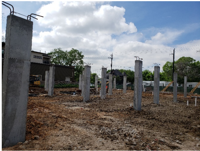
Removed forms on concrete columns at the residential site (04/06/20)