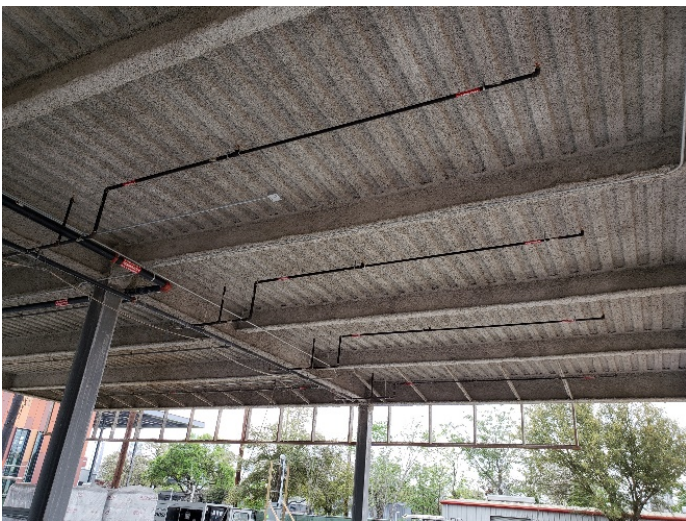
Fireproofing and fire sprinkler lines in place on bottom of 2 nd story (03/23/20)