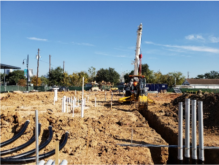
Install building plumbing & electrical lines (11/26/19)