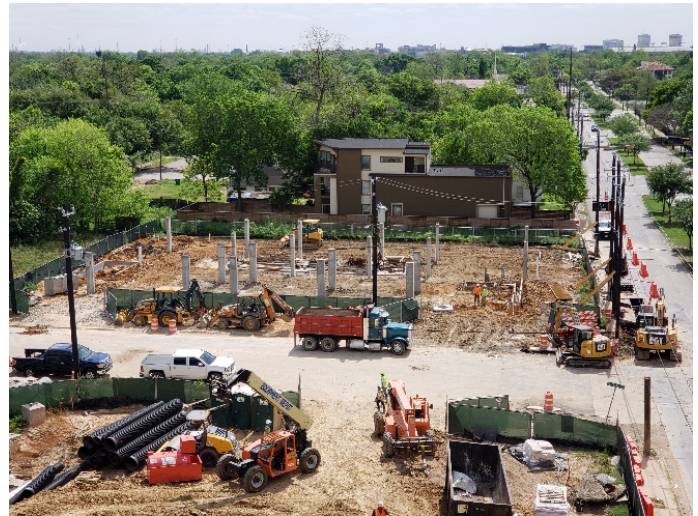
Residential site as seen from office building (04/06/20)