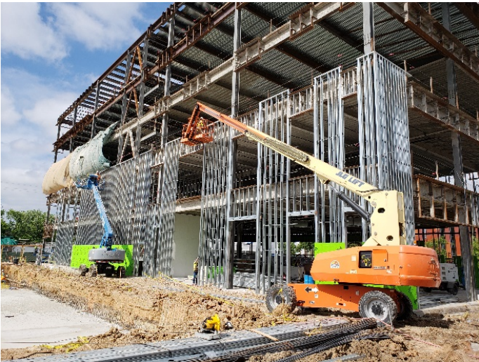
Two crews installing exterior wall studs & window frames on the east side of the office building (04/06/20)