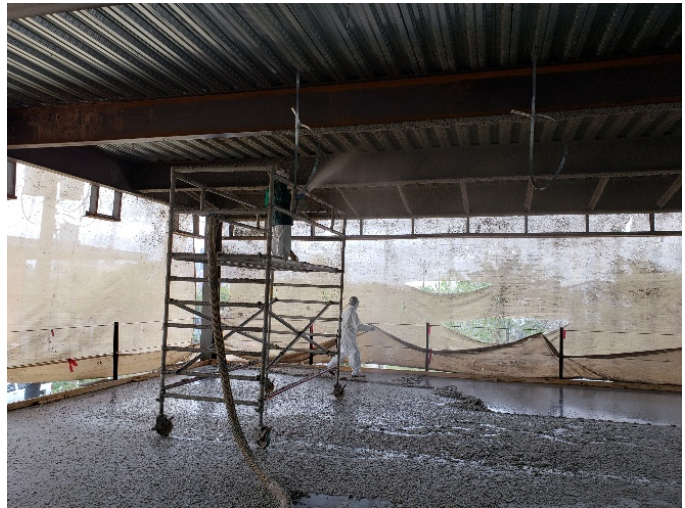
Fireproofing being applied to the bottom of the 3 rd story (03/23/20)