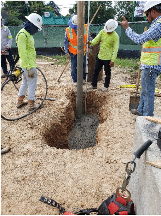
Concrete in drilled shafts for building (10/08/19)