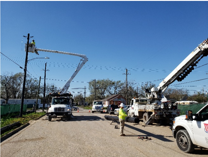
CenterPoint began relocation of overhead power lines on St. Charles & Elgin streets (02/17/20)