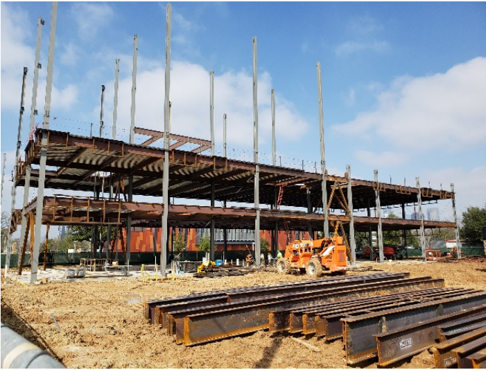
Erected structural steel at the northern end of the building for the 2 nd & 3 rd stories (01/27/20)