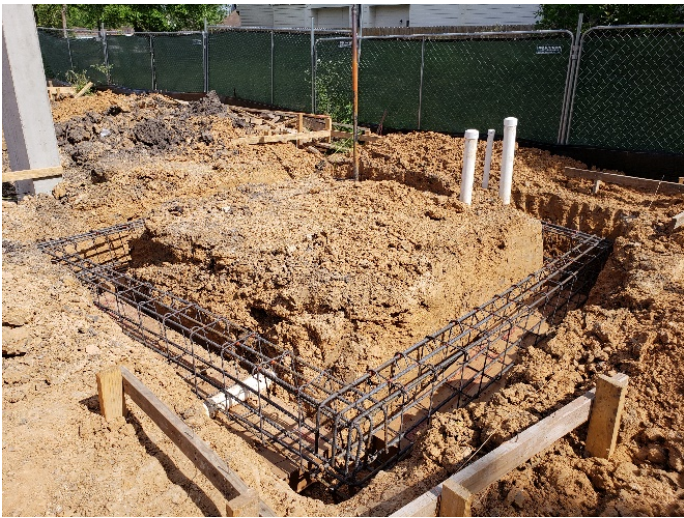
Installed rebar for utility building foundation at the residential site (04/06/20)