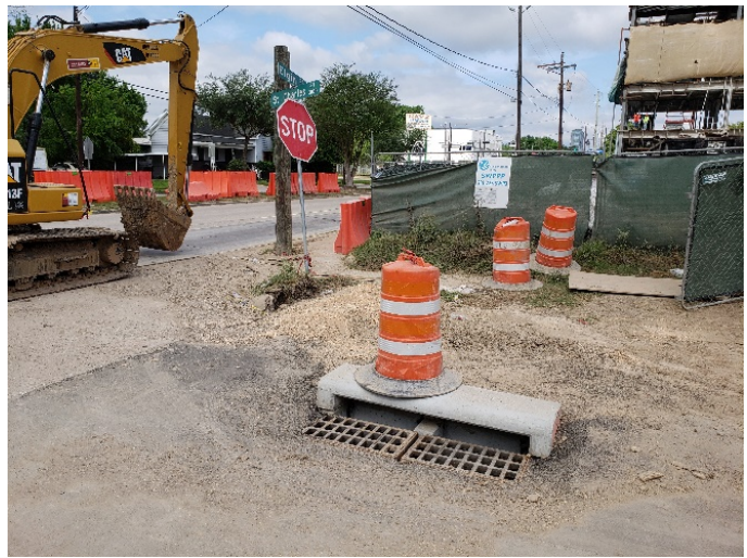
New storm sewer inlet at the northwest corner of St. Charles & Elgin (04/06/20)