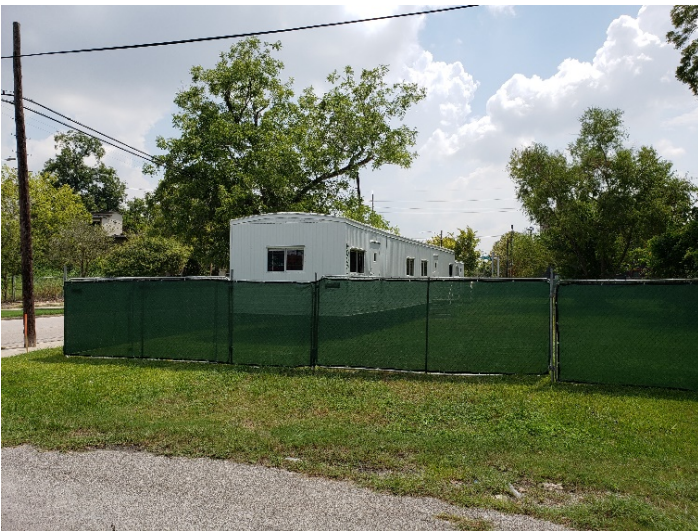
Field Office set up w/ perimeter fence (09/03/19)