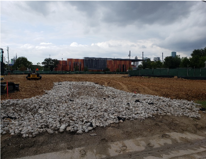
Backfill of AHOC building pads finished (09/17/19)