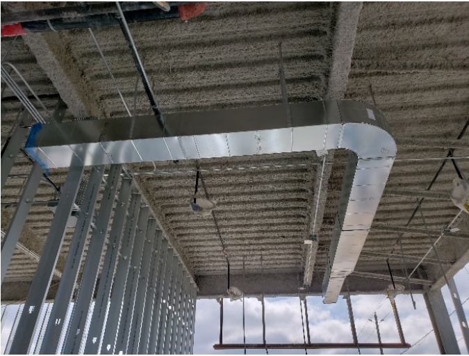
Installed more HVAC duct in office building (04/06/20)