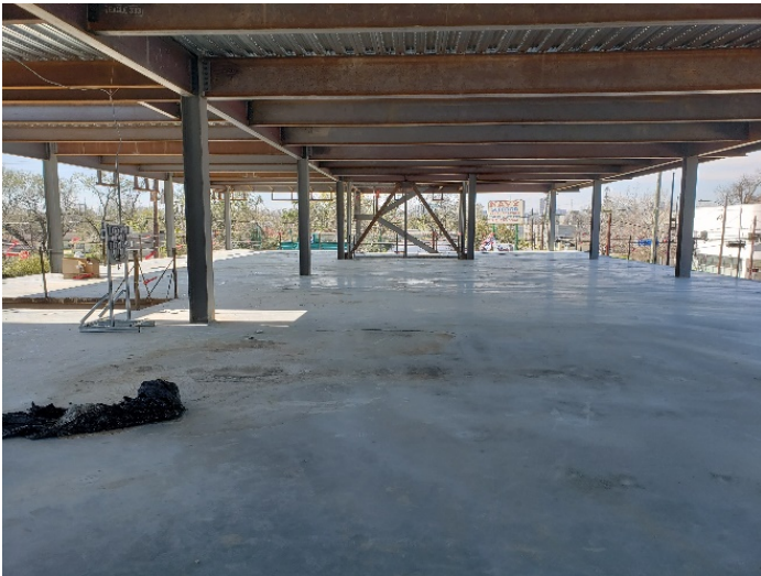
Placed concrete floor on the 2 nd story (03/02/20)