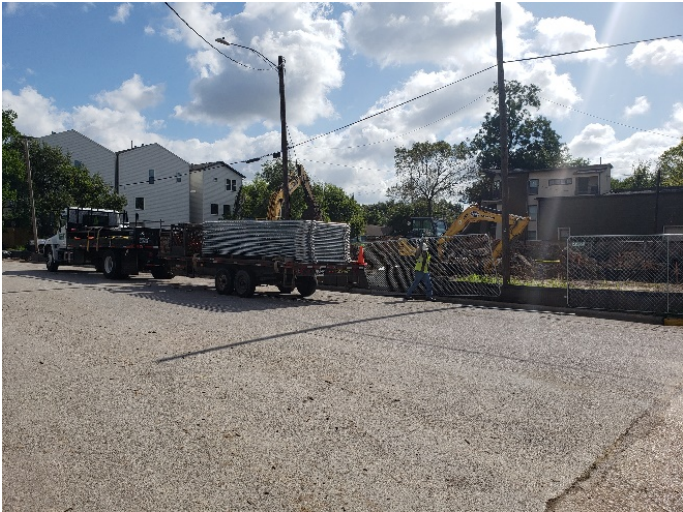
Set up perimeter fence around St. Charles site (10/01/19)