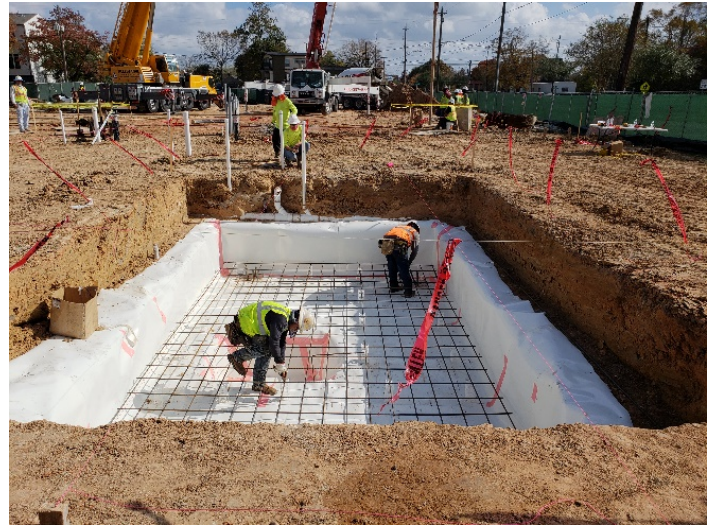
Form elevator shaft foundation for building (11/26/19)