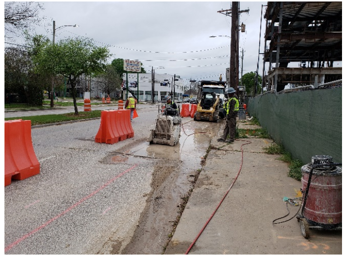
Pavement sawcutting for new CenterPoint ductbank on Elgin (03/23/20)