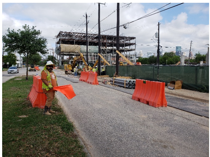
Flagman utilized to control traffic on Elgin during duct bank installation (04/06/20)