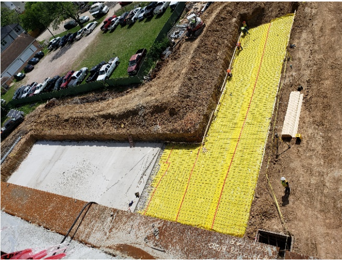
Concrete placed in bottom of northern half of stormwater detention vault under garage (04/06/20)