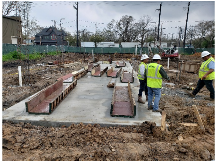
Concrete top in place for storm sewer vault at the residential site (03/16/20)