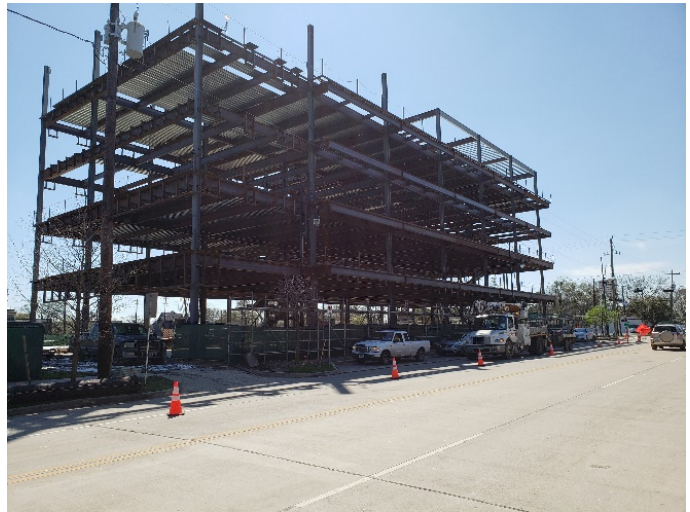
Protective covering installed along the Emancipation sidewalk to protect pedestrians from falling objects (02/24/20)