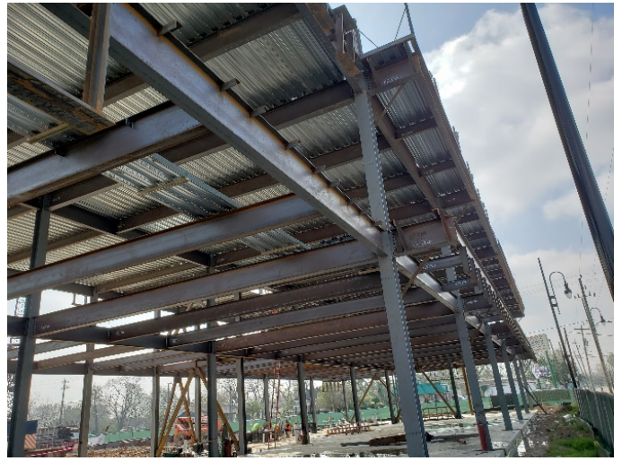
Installed floor decking on the 3 rd story (01/27/20)