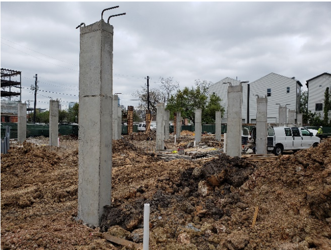
Concrete columns placed for residential podium (03/23/20)