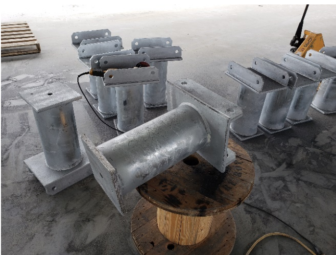
Steel davits prepped for installation (03/23/20)