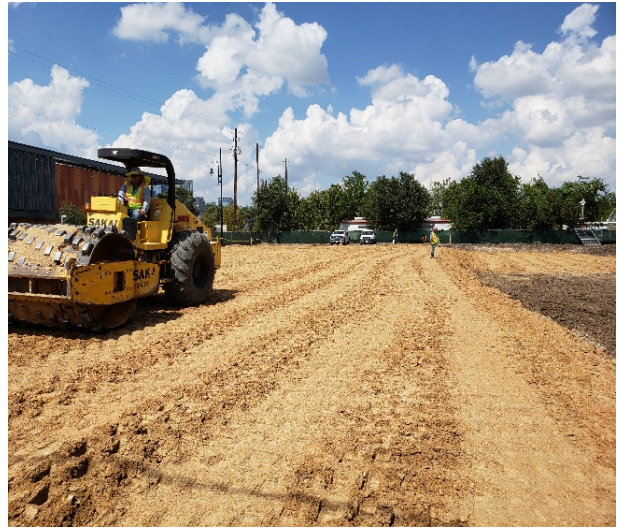
Compaction of backfill on building pad (09/10/19)