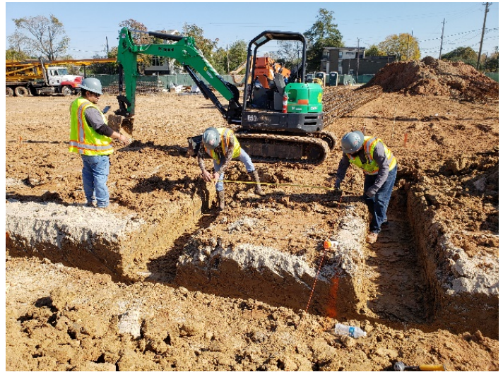
Began installing plumbing for office building (11/19/19)