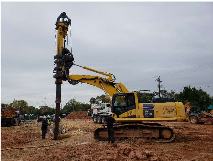
Large drill rig for drilling deep shaft (11/05/19)