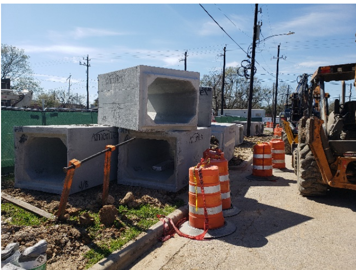
New box culvert storm sewer to be installed on St. Charles across Elgin (03/02/20)