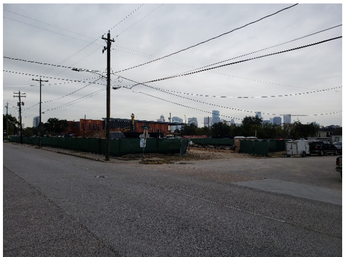
Site view from Elgin & St. Charles (11/05/19)