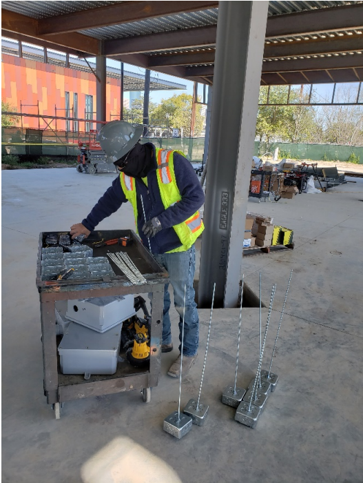
Electrician assembles electrical junction boxes (03/02/20)