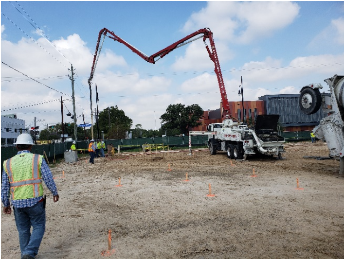
Concrete pumping for drilled shaft foundations (10/08/19)