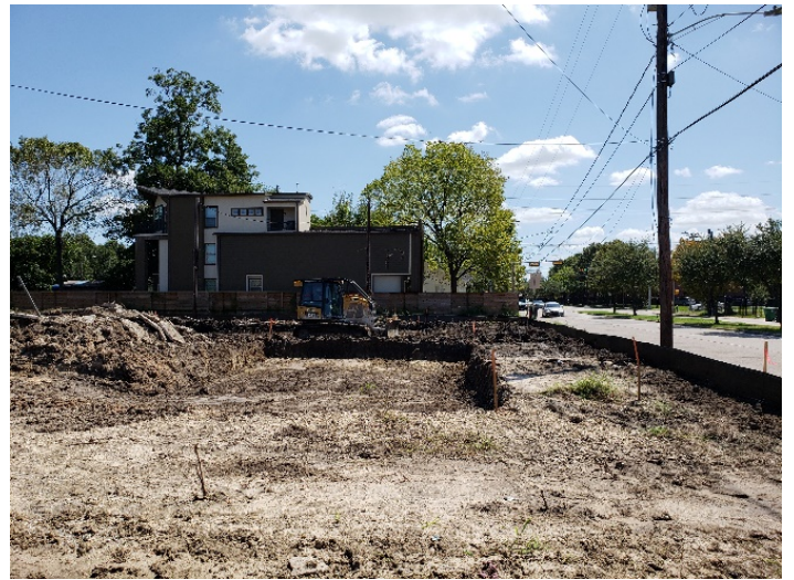
Began excavating building pad at St. Charles (09/24/19)