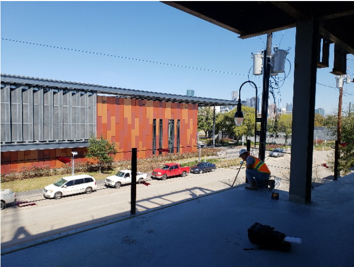
Workers began to layout walls & studs for the 2 nd story (03/02/20)