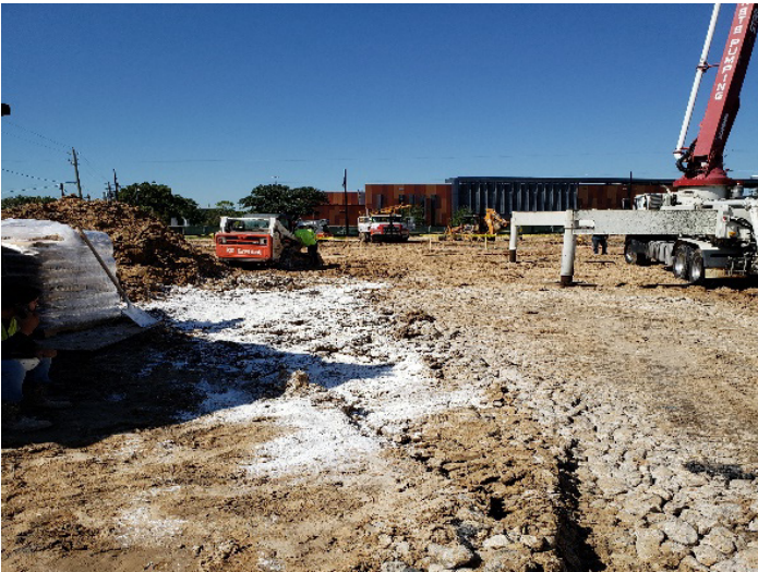
Lime placed to help dry the site (10/22/19)