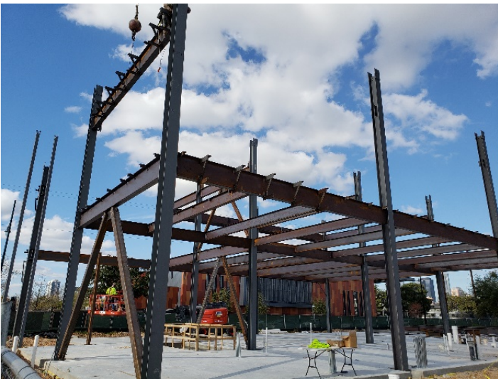
Erected structural steel up to the 3 rd floor for the southern end of the building (01/13/20)