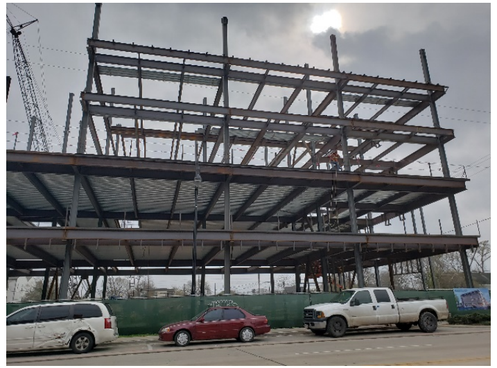
Floor decking in place now on 2 nd & 3 rd stories (02/10/20)