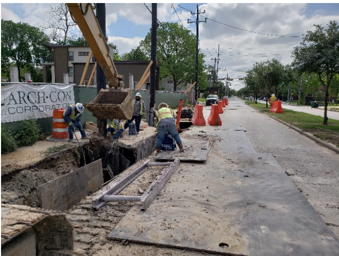
Installed duct bank on Elgin adjacent residential site (04/06/20)