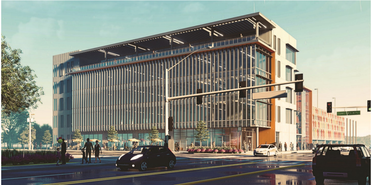
Emancipation Center One – Completion scheduled for December 2020