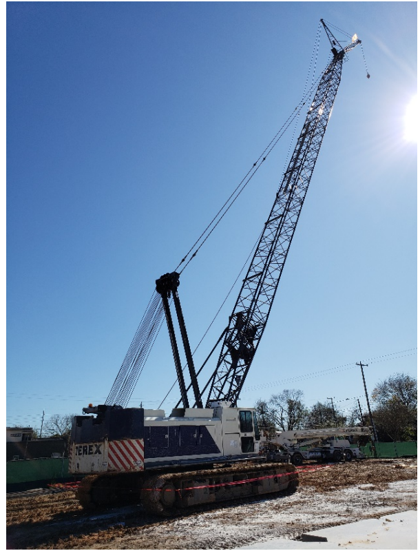
Crane on site to begin erecting the building (01/06/20)