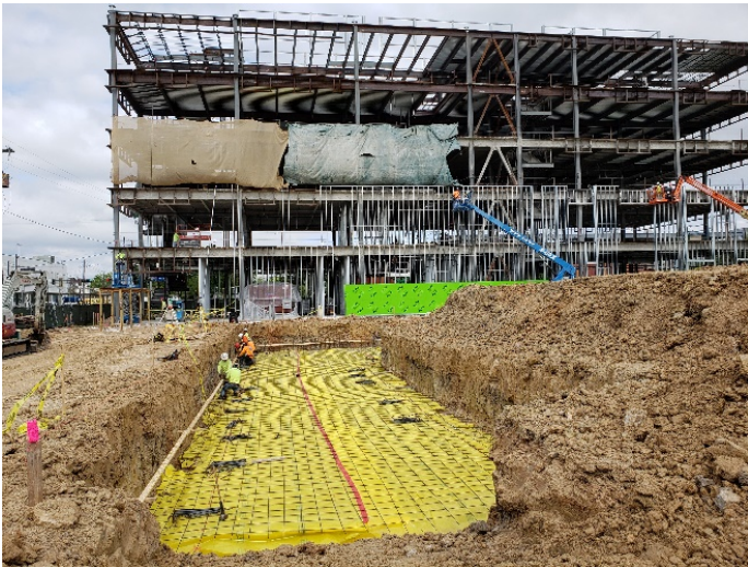
Installed rebar for bottom of southern half of stormwater detention vault (04/06/20)