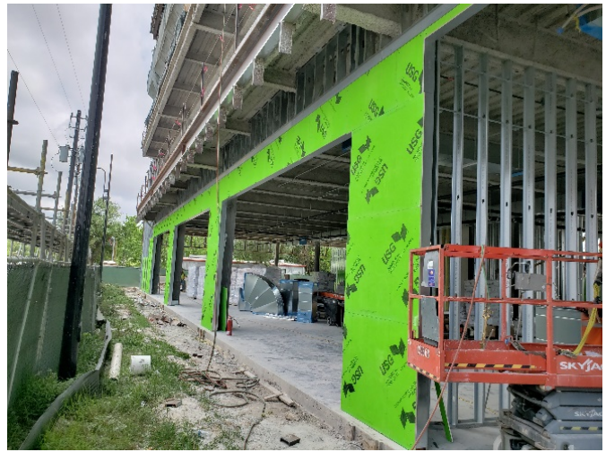
Close-up view of sheetrock being installed on the west side of the 1st floor of office building (04/06/20)