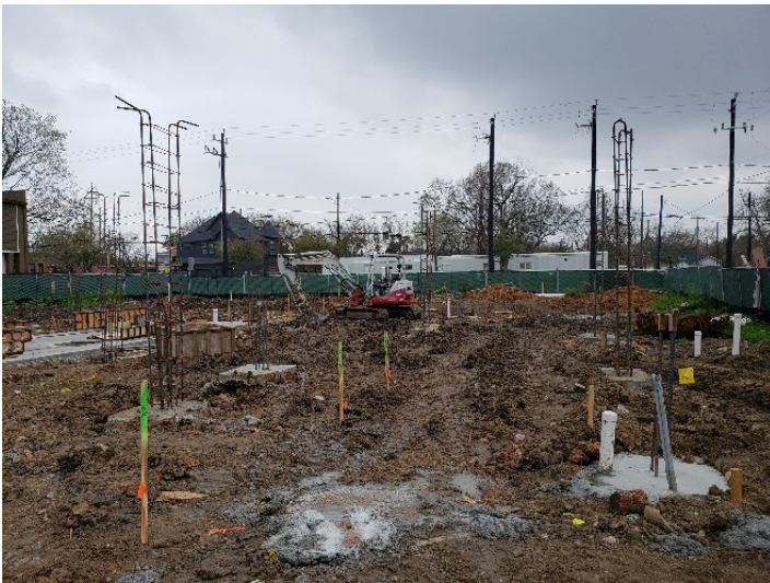
Column rebar installed for residential podium (03/16/20)