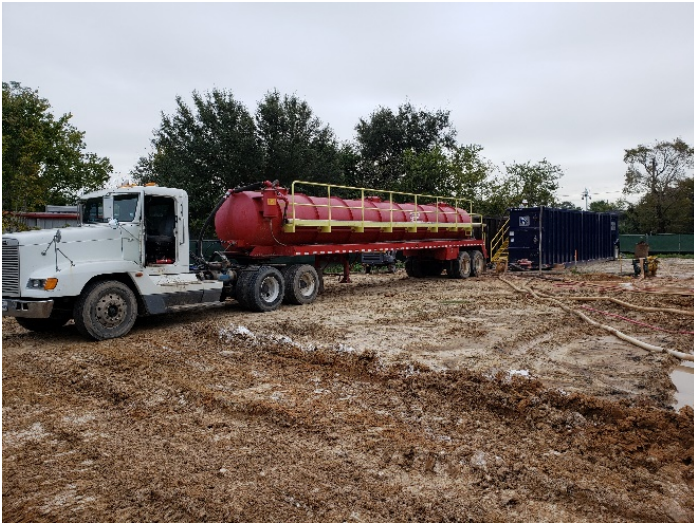
Truck hauls used drilling slurry from the site (11/12/19)